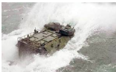
BAE Systems will produce Assault Amphibious Vehicles for the Japanese Ministry of Defense under a new $149 million contract.

BAE Systems has been awarded a contract to produce new Assault Amphibious Vehicles (AAVs) for the Japanese Ministry of Defense.