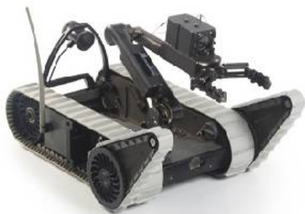
Endeavor Robotics, the U.S.-based, leading ground robotics company has received an order for 32 of