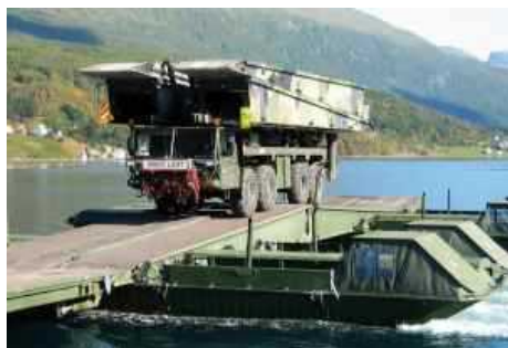
Krauss-Maffei Wegmann (KMW) has received a contract from the Norwegian Ministry of Defence for the upgrade of its LEGUAN bridgelayering systems.

A 9 Mio. EUR contract was recently signed by the Director of the Norwegian Defence Procurement