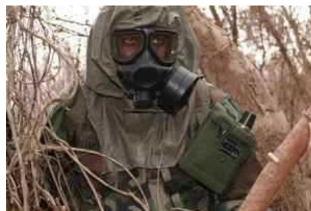
Edgewood, MD -- Smiths Detection, part of the global technology business Smiths Group, today announced that its Military unit has been awarded a $3.9 million firm-fixed price contract to supply the U.S. Department of Defense with lightweight detectors under its Joint Chemical Agent Detector (JCAD) program.

The M4 JCAD selected is based on the Smiths Detection Lightweight Chemical Detector (LCD), widely adopted by military forces globally. It is designed to help