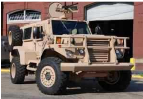
North Charleston, SC- Protected Vehicles, Inc. is pleased to announce development of its newest wheeled combat vehicle The Protector.

Designed to improve upon the shortcomings encountered by the current HMMWV in operational theatre during missions and patrols in Iraq and Afghanistan, The Protector offers advanced armor solutions to threats from both improvised explosive devices (IEDs) and the more recent and devastating explosively formed penetrators (EFP) utilized by the enemy. With a curb weight of only 14,000 pounds, The Protector offers improved safety from ballistics, IEDs and EFPs in a lighter package than the HMMWV. In addition to standard armor, The Protector is designed to accept the up-armor ShieldAll™, available exclusively from Protected Vehicles, Inc. This revolutionary next-generation composite armor material is not only a lighter, more capable and cost-effective armor solution to steel, but has also been repeatedly tested at U.S. Government facilities as a proven defense against deadly EFPs. As the threats on a new asymmetric battlefield continue to evolve, The Protector has arrived to mitigate risks, protect the war-fighters and accomplish the