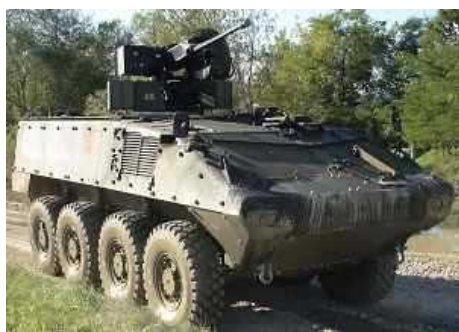
Haifa, Israel, -- Elbit Systems Ltd. announced today that it was awarded $55 million contracts in Europe.

In Slovenia, it signed a contract to supply overhead remote controlled weapon stations and unmanned turrets as well as other electronic and electro-optical systems and components for the Slovenian Armored Vehicle Program. Elbit Systems' portion of the Program is valued at approximately $ 40 million, with deliveries scheduled to take place through 2011.