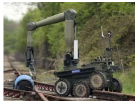
LONDON, -- Northrop Grumman Corporation has launched CUTLASS, its latest generation unmanned ground vehicle (UGV), expanding its range of industry-leading capabilities in unmanned systems for the remote handling and surveillance of hazardous threats.

CUTLASS has been designed, developed and manufactured by Northrop Grumman in the U.K., and includes significant advances in technology and performance and a range of features that provides state-of-the-art capabilities for national security and resilience applications.