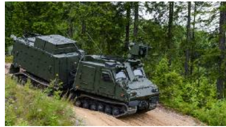
BAE Systems has signed a $120 million (SEK 800m) contract to supply an additional 102 BvS10 all-terrain vehicles to Sweden.

Similar capabilities were proven during Excalibur testing in October from the Swedish Archer and U.S. howitzers.