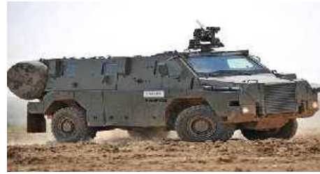
The vehicles are all troop carrier variants equipped with Thales's SOTAS M2 communication system, and deliveries will begin in 2015.

The contract also includes a five-year support package to ensure the highest levels of availability and performance.