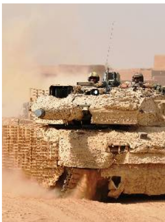
Cassidian Optronics GmbH, a subsidiary of Airbus Defence and Space, has received an order valued at more than 40 million euros from Krauss-Maffei