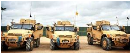
The contract will transform the way the army's vehicles are maintained, repaired and stored.

It also has the potential to grow to around B2 billion as a result of plans, subject to value for money, to optimise a broader scope of services.