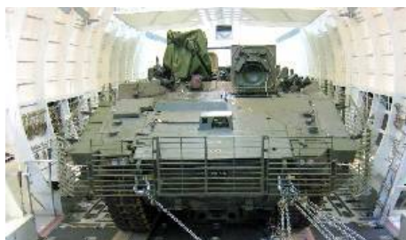
Oakdale, South Wales -- General Dynamics Land Systems-UK has completed initial air portability trials for the AJAX family of vehicles at the Joint Air Delivery Test and Evaluation Unit (JADTEU) at Royal Air Force (RAF) Brize Norton.

The trials, which took place at the end of May, assessed the loading of the ARES prototype platform,