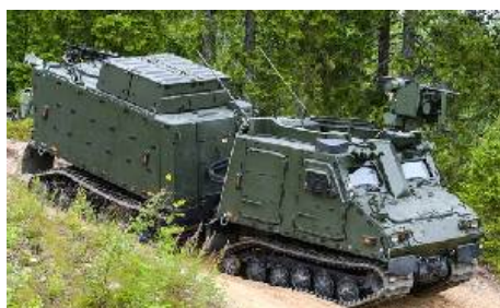
BAE Systems has been awarded a contract to