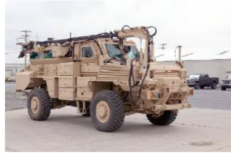
CHAMBERSBURG, Pa. -- A ceremony celebrating the successful production of the latest version of the RG31, a mine-resistant ambush protected route clearance vehicle, was held on July 19 at Letterkenny Army Depot.

The rollout ceremony featured the latest variant of the RG31's configuration. Among the improvements were an engine upgrade from 275 to 300 horsepower; a transmission upgrade from 2500 to a 3000 series; an independent suspension for improved mobility; 360-degree spotlights for night visibility; and an armored gunner's hatch.