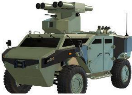
The Turkish MoD Undersecretariat for Defense Industries Signs the Contract for the Anti-Tank Vehicle Project with FNSS.

Contract negotiations held with FNSS Savunma Sistemleri A.Ş. in relation to the Anti-Tank Vehicle Project, which were initiated by the Defense Industry Executive Committee's decision taken on March 9, 2016, have recently been concluded, and the project contract was officially signed on June 27, 2016, at a ceremony held in the Undersecretariat for Defense Industries.