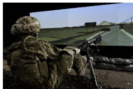
Meggitt PLC (“Meggitt” or “the Group”), a leading international company specialising in high performance components and sub-systems for the aerospace, defence and energy markets announces