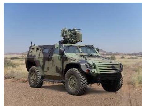
Otokar, the largest privately owned defence industry company in Turkey, has announced that they have received a €106.1 million order for COBRA II tactical wheeled armoured vehicles to be