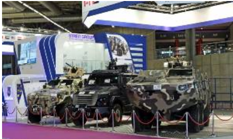
STREIT Group to showcases the Alligator 6Γ—6 is a new type of tactical armored vehicle at Eurosatory 2016.

Alligator 6Γ—6 is a tactical armored vehicle with advanced ballistic and blast protection, ensuring crew survivability in the modern day battle field. Alligator can be used as a platoon strength troop carrier, 8 dismounts and a commander and driver and can also be configured as a command and control platform, forward observation vehicle (FOO) or in a convoy support role.