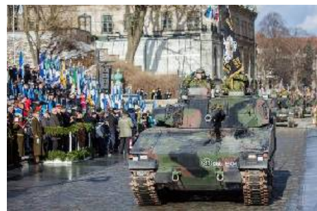
CV90 in the national day parade in Tallinn, Estonia on 24 February.

BAE Systems and the Estonian government have signed contracts to maintain and sustain the country’s fleet of CV9035 Infantry Fighting Vehicles (IFVs).