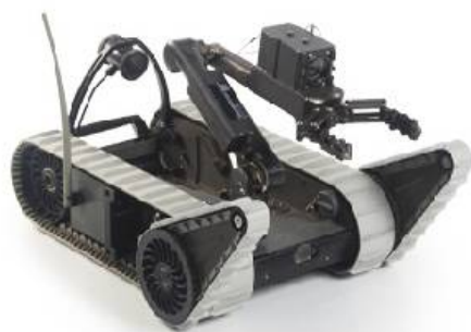
Endeavor Robotics, the U.S.-based, leading ground robotics company has received an order for 32 of