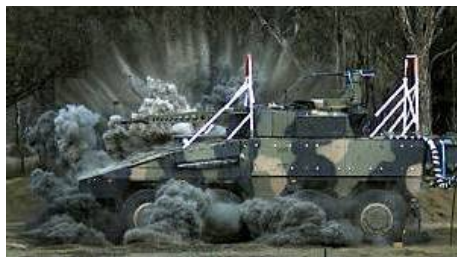
A final series of blast tests have been completed on the two shortlisted contenders vying to become the Australian Defence Force’s new Combat Reconnaissance Vehicle.

To assess their survivability, Rheinmetall’s Boxer and BAE Systems Australia’s AMV-35, were exposed to simulated mine blasts at Defence’s Proof and Experimental Establishment at Graytown in Victoria.