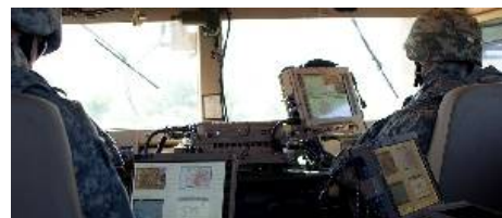
ARLINGTON, VA -- Leonardo DRS, Inc. announced today that it has received an additional $58 million in orders from the U.S. Army Mission Command Program Office to provide next-generation combat computing systems called the Mounted Family of Computer Systems, or MFoCS.

The contract brings the 2017 total MFoCS sales from the U.S. Army to more than $110 million from an indefinite delivery/indefinite quantity contract. Leonardo DRS is performing the work in its Melbourne, Florida facility.