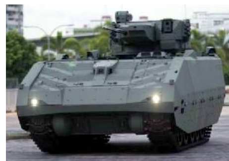
RESTON, Va --Science Applications International Corp. (SAIC) announced that it will compete to rapidly develop combat vehicle prototypes to meet