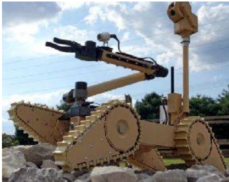
HUNTSVILLE, Ala. -- Northrop Grumman Corporation’s subsidiary Remotec Inc. is unveiling the newest member of the Andros line of proven unmanned ground vehicles (UGVs), the Interoperability Profile (IOP)-compliant Nomad.

Northrop Grumman’s newest UGV, the Andros Nomad, has four independent track pods that provide extreme mobility with stability climbing uneven terrain, complex obstacles and inclines as steep as 60 degrees.