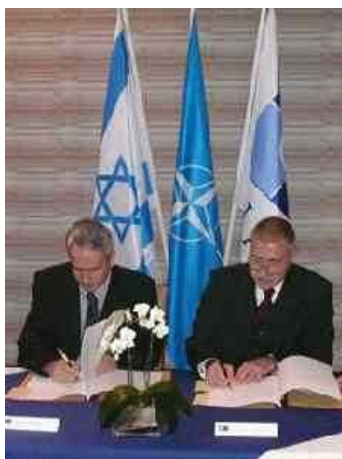
On 21 November, in a ceremony held at NAMSA, the Agency signed a Memorandum of Understanding (MOU) on Logistic Support Cooperation with Israel.

The MOU is of particular importance to many NATO nations currently operating equipment of Israeli origin as it facilitates access to Israeli industry for the acquisition of unique spares and services. Currently NAMSA has to