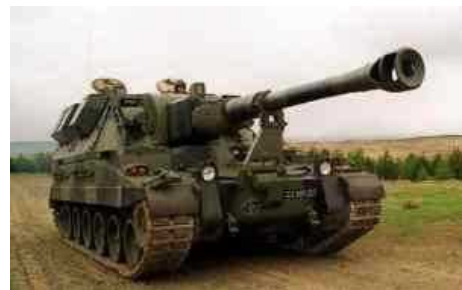
The Army's current AS90 guns are to get a sophisticated new weapon that can more accurately seek out and destroy hostile armoured vehicles at long range (up to 22.5 km), day and night, in all weathers and in difficult terrain, such as forests and urban areas.

This new smart weapon, the Ballistic Sensor Fused Munition (BSFM), consists of a shell that can be fired from the AS90 artillery gun. Munitions drop by parachute, using sensors to seek out enemy targets as they drift down. This new smart technology will enable the artillery to target the enemy with much greater accuracy and will greatly reduce collateral damage.