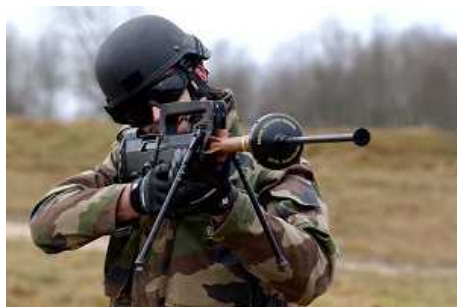
Rafael Advanced Defense Systems Ltd. has been awarded a contract by the US Army worth $52M for the Simon (GREM) door breaching rifle grenade.

The Simon or GREM as it is known in the US is a lightweight, rifle-launched grenade specially adapted to breaching steel or wooden doors from a stand-off distance, and may be fired from a variety of rifles using regular bullets.