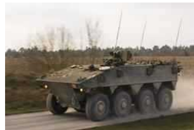
On 19th October 2007, the DGA (the French armement procurement agency) issued a purchase order to Nexter for the delivery of 117 infantry combat armoured vehicles (VBCI).

This order completes the initial order for 65 vehicles, the first 41 of which will be delivered to the French Army during the second half of 2008, in accordance with the initial schedule.