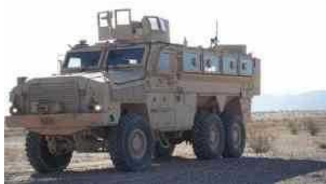
BAE Systems has received two new delivery orders from the U.S. Marine Corps totaling $322 million for 600 RG33 Mine Resistant Ambush Protected (MRAP) vehicles.

BAE Systems is currently contracted to build three of the five MRAP variants, and now under contract to deliver 1,462 Category I vehicles and 1,176 Category II vehicles.