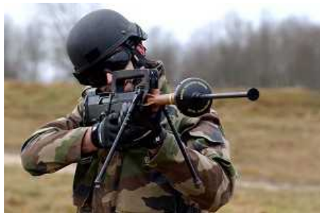
Rafael Advanced Defense Systems Ltd. has been awarded a contract by the US Army worth $52M for the Simon (GREM) door breaching rifle grenade.

The Simon or GREM as it is known in the US is a lightweight, rifle-launched grenade specially adapted to breaching steel or wooden doors from a stand-off distance, and may be fired from a variety of rifles using regular bullets.