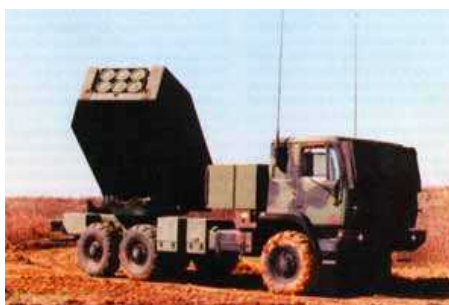
Lockheed Martin successfully conducted two Guided