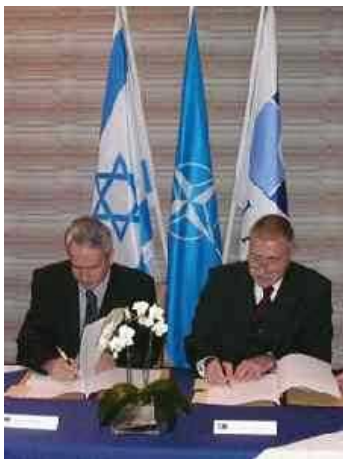
On 21 November, in a ceremony held at NAMSA, the Agency signed a Memorandum of Understanding (MOU) on Logistic Support Cooperation with Israel.

The MOU is of particular importance to many NATO nations currently operating equipment of Israeli origin as it facilitates access to Israeli industry for the acquisition of unique spares and services. Currently NAMSA has to