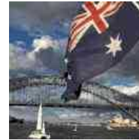
Acquisitions will provide a strong regional presence in Canberra, Melbourne, Sydney, Brisbane and Adelaide.

QinetiQ Group plc, an international defence and security technology company, announces today that it has signed agreements to purchase two Australian defence consulting businesses, Ball Solutions Group Pty Ltd and Novare Services Pty Ltd. These acquisitions are being acquired for a total cash consideration of A$20 million and are subject to regulatory approval. They represent QinetiQ's first investment in Australia and provide the company with a presence of 185 staff located in Canberra, Sydney, Melbourne, Brisbane and Adelaide.