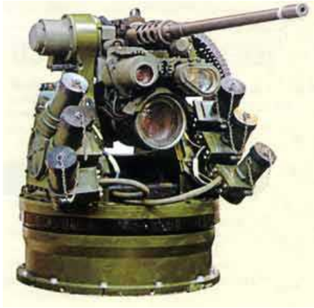
KONGSBERG has been awarded an order (valued at 250 millions of Norwegian kronas) by Stork PWV B.V. for the delivery of PROTECTOR weapon control systems to the Dutch BOXER 8x8 vehicle program.

The Netherlands will be the 10th country to choose PROTECTOR to safeguard its military vehicles.