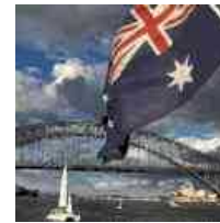
Acquisitions will provide a strong regional presence in Canberra, Melbourne, Sydney, Brisbane and Adelaide.

QinetiQ Group plc, an international defence and security technology company, announces today that it has signed agreements to purchase two Australian defence consulting businesses, Ball Solutions Group Pty Ltd and Novare Services Pty Ltd. These acquisitions are being acquired for a total cash consideration of A$20 million and are subject to regulatory approval. They represent QinetiQ's first investment in Australia and provide the company with a presence of 185 staff located in Canberra, Sydney, Melbourne, Brisbane and Adelaide.