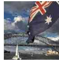
Acquisitions will provide a strong regional presence in Canberra, Melbourne, Sydney, Brisbane and Adelaide.

QinetiQ Group plc, an international defence and security technology company, announces today that it has signed agreements to purchase two Australian defence consulting businesses, Ball Solutions Group Pty Ltd and Novare Services Pty Ltd. These acquisitions are being acquired for a total cash consideration of A$20 million and are subject to regulatory approval. They represent QinetiQ's first investment in Australia and provide the company with a presence of 185 staff located in Canberra, Sydney, Melbourne, Brisbane and Adelaide.