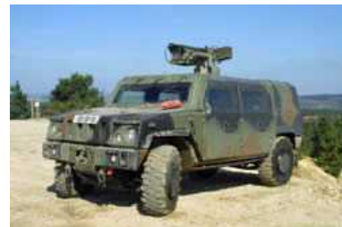
The Light Multirole Vehicle (LMV), the tactical vehicle with full-time all wheel drive called "Lince" by the Italian military and "Panther" by the English, continues to be an active player on the international scene.

The LMV, entirely designed and assembled by Iveco Defence Vehicles in Bolzano, avails itself of sophisticated technology whose strong points are its outstanding mobility let alone its anti-mine protection properties, proved on many occasions in its diverse peace keeping role.