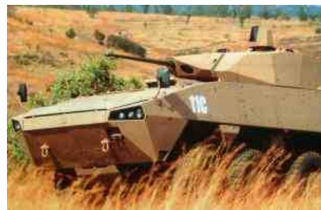
The United Arab Emirates' Armed Forces have ordered Patria AMV 8x8 armoured wheeled vehicles.