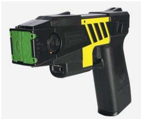
SCOTTSDALE, Ariz. -- TASER International, Inc., a market leader in advanced electronic control devices, released the following News Alert:

According to an article in the December 27, 2007 edition of the Edmonton Sun, Edmonton police are crediting the use of a TASER(r) device for avoiding tragedy after a knife-wielding fugitive ran into a crowded toy store on Wednesday.