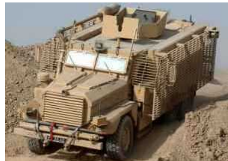
A B160million contract to deliver the new generation of Mastiff vehicles - the Mastiff 2 - has been announced by UK Defence Secretary Des Browne on a visit to NP Aerospace.