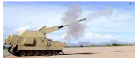
YUMA PROVING GROUND, Ariz. -- The Future Combat Systems program successfully fired the first artillery projectile from the manned ground vehicle non-line-of-sight cannon prototype.