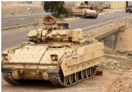
YORK, Pa. -- BAE Systems, under a $742 million U.S. Army contract, will remanufacture more than 300 Bradley vehicles with additional armor to protect soldiers.

The contract is an option to a previously awarded contract for work on 252 Bradley vehicles.