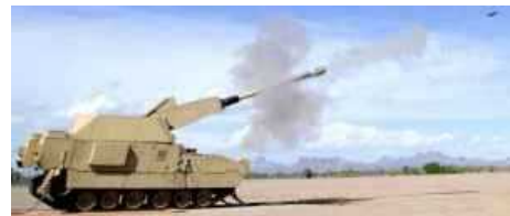
YUMA PROVING GROUND, Ariz. -- The Future Combat Systems program successfully fired the first artillery projectile from the manned ground vehicle non-line-of-sight cannon prototype.