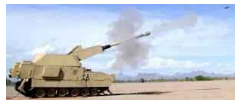
YUMA PROVING GROUND, Ariz. -- The Future Combat Systems program successfully fired the first artillery projectile from the manned ground vehicle non-line-of-sight cannon prototype.