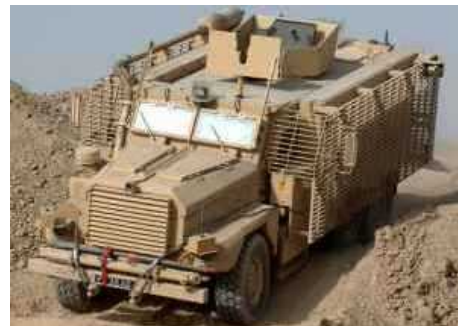
A £60million contract to deliver the new generation of Mastiff vehicles - the Mastiff 2 - has been announced by UK Defence Secretary Des Browne on a visit to NP Aerospace.