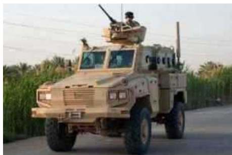
CAPE TOWN, South Africa -- BAE Systems has launched the newest version of its acclaimed RG series of mine resistant personnel carrier vehicle, the RG31 Mk6E, which will make its debut at the African Aerospace & Defence 2008 show in Cape Town (17-21 September).

Since receiving a Canadian armed forces order for RG31 Mk3 vehicles in 2003, the Benoni-based company's RG-series of products have boosted South African exports by more than ZAR3.5 billion ($430 million) with a steadily increasing series of additional orders for vehicles, spares and support from new customers around the globe. It has also created over 300 news jobs at its factory near Johannesburg and many more throughout its supplier network.