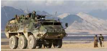
New material is selected by Ten Cate in vehicle up-armor project for Dutch military in Afghanistan.

DSM Dyneema launched Dyneema BT10, its first commercially available product made from a novel, proprietary ballistic tape (BT) technology. The announcement was made jointly at the DVD exhibition, (Millbrook, UK), with Ten Cate Advanced Armour, who has selected Dyneema BT10 for armor upgrading on the Patria XA-188 APC commissioned by the Dutch DMO (Defensie Materieel Organisatie). The vehicles will be used by the Dutch military forces stationed in Afghanistan and delivery is expected to be completed by October 2009.