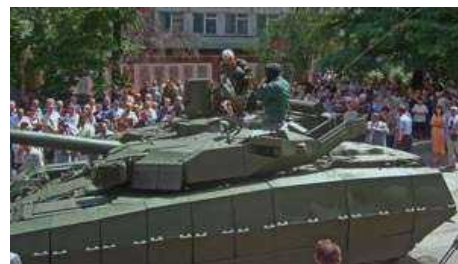
On 16 June 2009 Volodymyr M. Lytvin, the Chairman of the Supreme Rada (Ukrainian parliament), visited the State-Owned Enterprise Kharkiv Morozov Machine Building Design Bureau (SOE KMDB).

The head of the Ukrainian parliament examined the armoured vehicles developed and manufactured by SOE KMDB (including the newest Ukrainian Oplot main battle tank, Dozor light armoured personnel carrier, BTR-4 and BTR-3U armoured personnel carriers, BMPT-72 heavy infantry combat vehicle and computer-based tank crew training simulators), as well as personally driving the Oplot tank for almost half a kilometre.