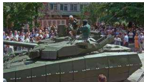
On 16 June 2009 Volodymyr M. Lytvin, the Chairman of the Supreme Rada (Ukrainian parliament), visited the State-Owned Enterprise Kharkiv Morozov Machine Building Design Bureau (SOE KMDB).

The head of the Ukrainian parliament examined the armoured vehicles developed and manufactured by SOE KMDB (including the newest Ukrainian Oplot main battle tank, Dozor light armoured personnel carrier, BTR-4 and BTR-3U armoured personnel carriers, BMPT-72 heavy infantry combat vehicle and computer-based tank crew training simulators), as well as personally driving the Oplot tank for almost half a kilometre.