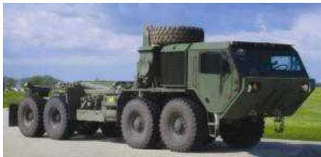
OSHKOSH, Wis. -- Oshkosh Defense, a division of Oshkosh Corporation, has been awarded a delivery order from the U.S. Army Tank-automotive and Armaments Command (TACOM) Life Cycle Management Command (LCMC) to supply more than 100 next-generation Oshkosh® Heavy Expanded Mobility Tactical Trucks (HEMTT) to the U.S. Army National Guard.

The delivery order, the first the company has received for its new HEMTT A4 vehicles for the National Guard and issued under the Family of Heavy Tactical Vehicles (FHTV) contract, is valued at more than $38 million. Under the delivery order, Oshkosh Defense will manufacture and supply more than 100 new HEMTT A4s. The variants that will be produced are the M978A4 fuel tanker and the M985A4 cargo truck.