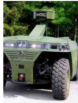
SUNNYVALE -- 2009—Real-Time Innovations (RTI), The Real-Time Middleware Experts, today announced that Base Ten Systems Electronics GmbH (Base10) has selected RTI Data Distribution Service for their unmanned ground-based vehicle (UGV) project.

When the German Ministry of Defense needed the expertise to develop a UGV for deployment in hazardous environments, Base 10 was the natural choice. Base 10 has over 30 years of experience in the use and adaptation of commercial electronics and microprocessor technology for military applications.