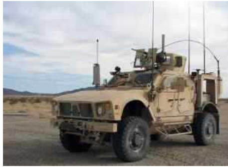
The U.S. Army has outfitted a handful of MRAP vehicles with Network Integration Kits.

The U.S. Army has outfitted a handful of Mine Resistant Ambush Protected, more commonly referred to as MRAP, vehicles with Network Integration Kits designed to give the bomb-defeating vehicles the ability to share real-time information such as sensor data from robots and UAVs while on-the-move in combat, service officials said.