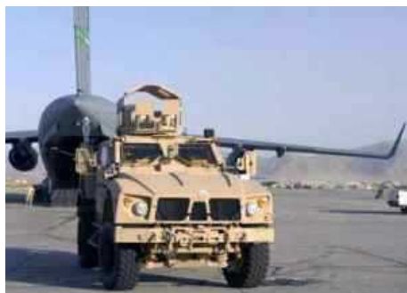
WASHINGTON -- The mine-resistant ambush-protected all-terrain vehicle, or M-ATV, is on its way to Afghanistan to replace many of the up-armored Humvees.