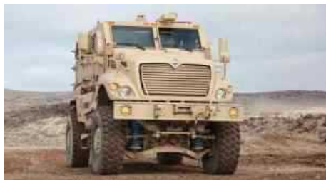
The improved suspension is aimed at providing better off-road capability in the rough.

The Pentagon has ordered more than 1,300 new Mine