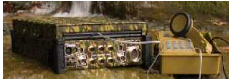
AT Communication is proud to announce the launch of the AT VAS-1 VoIP PABX and Telecommunications Server.

The AT VAS-1 is a military/industrial grade field hub for Voice and Data communications. Using a web based setup tool the system can be easily configured to provide a multifaceted communications from simple analog telephony through to complex IP routing and video conferencing. Once the system is configured – reconnection is automatic.