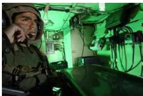
Among the systems highlighted at the show: The Dominator® concept, Mini-UAS, solutions for Armored Fighting Vehicles, tactical radio systems, advanced thermal imaging and more.

Elbit Systems will present a vast array of advanced next-generation systems and solutions at the upcoming International Defence Exhibition Bratislava (IDEB), set to take place in Slovakia from 5-7 May, 2010.