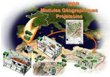
A new method of comprehending the environment in a theatre of operations through autonomous mobile modules.

EADS Defence & Security (DS) and Thales have received a contract worth 26.1 million euros from the French defence procurement agency DGA (Direction Generale de l'Armement) to produce and support two sets of MGPs (Modules Géographiques Projétables - deployable geographic modules) for the 28th Geographic Group of the French Army. The operation, for which DS has been designated prime contractor, aims to develop a system that is deployable and reactive in terms of production, maintenance and distribution of military geography information. The MGP modules will be used to supply geographic data updated in the field to operational land forces via a single cartographic access point.