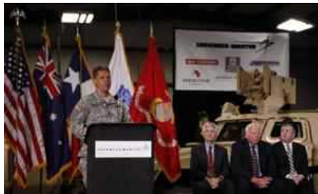
SEALY, TX -- Lockheed Martin today delivered the first two of seven operational Joint Light Tactical Vehicles (JLTV), and one companion trailer, to the U.S. Army and Marine Corps for Technology Development (TD) phase testing.

The vehicles, two JLTV Category B Infantry Carriers, feature a curb weight of 15,500 pounds and were signed over to the Department of Defense, ahead of schedule, in an acceptance ceremony today.