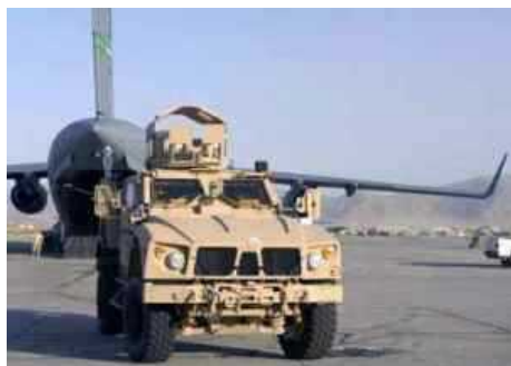
WASHINGTON -- The mine-resistant ambush-protected all-terrain vehicle, or M-ATV, is on its way to Afghanistan to replace many of the up-armored Humvees.

"It will not be too long before we will be able to get everybody who can be out of the up-armored Humvee into the MRAP ATV," said Vice Chief of Staff of the Army Gen. General Peter W. Chiarelli.