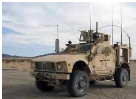
The U.S. Army has outfitted a handful of MRAP vehicles with Network Integration Kits.

The U.S. Army has outfitted a handful of Mine Resistant Ambush Protected, more commonly referred to as MRAP, vehicles with Network Integration Kits designed to give the bomb-defeating vehicles the ability to share real-time information such as sensor data from robots and UAVs while on-the-move in combat, service officials said.