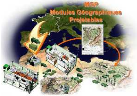
A new method of comprehending the environment in a theatre of operations through autonomous mobile modules.

EADS Defence & Security (DS) and Thales have received a contract worth 26.1 million euros from the French defence procurement agency DGA (Direction Generale de l'Armement) to produce and support two sets of MGPs (Modules Géographiques Projétables - deployable geographic modules) for the 28th Geographic Group of the French Army. The operation, for which DS has been designated prime contractor, aims to develop a system that is deployable and reactive in terms of production, maintenance and distribution of military geography information. The MGP modules will be used to supply geographic data updated in the field to operational land forces via a single cartographic access point.