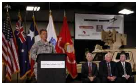
SEALY, TX -- Lockheed Martin today delivered the first two of seven operational Joint Light Tactical Vehicles (JLTV), and one companion trailer, to the U.S. Army and Marine Corps for Technology Development (TD) phase testing.

The vehicles, two JLTV Category B Infantry Carriers, feature a curb weight of 15,500 pounds and were signed over to the Department of Defense, ahead of schedule, in an acceptance ceremony today.