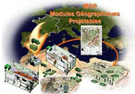
A new method of comprehending the environment in a theatre of operations through autonomous mobile modules.

EADS Defence & Security (DS) and Thales have received a contract worth 26.1 million euros from the French defence procurement agency DGA (Direction Generale de l'Armement) to produce and support two sets of MGPs (Modules Géographiques Projétables - deployable geographic modules) for the 28th Geographic Group of the French Army. The operation, for which DS has been designated prime contractor, aims to develop a system that is deployable and reactive in terms of production, maintenance and distribution of military geography information. The MGP modules will be used to supply geographic data updated in the field to operational land forces via a single cartographic access point.