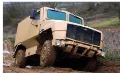
The Supacat Protected Vehicle (SPV400) today received its International Media Launch at the Long Valley Test Ground, Aldershot, UK.

The SPV400 is the contender from British high mobility vehicle specialist, Supacat, for the UK Ministry of Defence's Light Protected Patrol Vehicle (LPPV) programme. Under an Urgent Operational Requirement the UK MoD is expected to order an initial batch of 200 vehicles to enter service in early 2011.