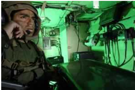
Among the systems highlighted at the show: The Dominator® concept, Mini-UAS, solutions for Armored Fighting Vehicles, tactical radio systems, advanced thermal imaging and more.

Elbit Systems will present a vast array of advanced next-generation systems and solutions at the upcoming International Defence Exhibition Bratislava (IDEB), set to take place in Slovakia from 5-7 May, 2010.