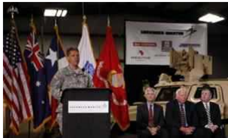
SEALY, TX -- Lockheed Martin today delivered the first two of seven operational Joint Light Tactical Vehicles (JLTV), and one companion trailer, to the U.S. Army and Marine Corps for Technology Development (TD) phase testing.

The vehicles, two JLTV Category B Infantry Carriers, feature a curb weight of 15,500 pounds and were signed over to the Department of Defense, ahead of schedule, in an acceptance ceremony today.