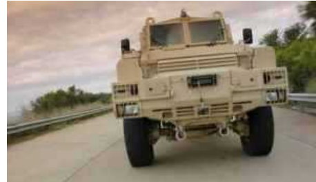
LONDON, Ontario -- U.S. Marine Corps Systems Command (MCSC) has awarded General Dynamics Land Systems-Canada a $33.2 million delivery order to produce 21 RG-31 Mk5EM and 6 RG-31 Mk5E vehicles for its Mine Resistant Ambush Protected (MRAP) vehicle program.

General Dynamics Land Systems, the Canadian company's parent corporation, is a business unit of General Dynamics.