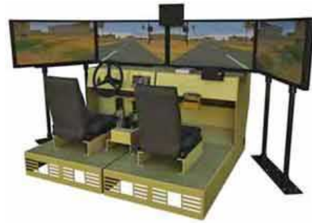
Daytona Beach, Fla. – Raydon Corp. was awarded on July 9 a $36,355,550 firm-fixed-price contract.

This contract is for 11 Mine Resistant Ambush Protected Vehicle virtual trainers for the Army National Guard. Work is to be performed in Daytona Beach, Fla., with an estimated completion date of Nov. 30, 2011. Over 50 bids were solicited with one bid received. National Guard Bureau, ZC-AQ, Arlington, Va., is the contracting activity (W9133L-10-F-0130).