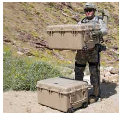
ORLANDO -- Lockheed Martin has received a $1.1 million contract from the U.S. Army Natick Soldier Center for test and evaluation of its next-generation HULC™ advanced robotic exoskeleton, designed to augment Soldiers' strength and endurance, as well as reduce load carriage injuries.

Under this contract, the U.S. Army will test Lockheed Martin's advanced ruggedized HULC design. The upgraded HULC system includes optimized control software, extended battery life and human factors improvements for quicker and easier sizing to each user. Lockheed Martin is also exploring exoskeleton designs to support industrial and medical applications.