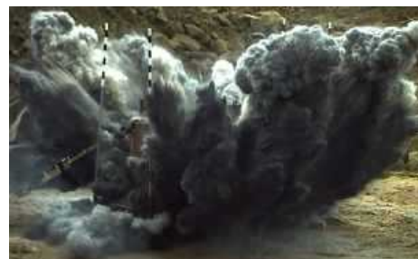
The all-new, all-British Supacat SPV400, which is competing to win a UK Ministry of Defence J200 million Urgent Operational Requirement for a Light Protected Patrol Vehicle (LPPV) to replace the Snatch Land Rover, last week completed a fourth round of blast tests.

These tests were conducted despite the LPPV bid having already been submitted to the MoD.