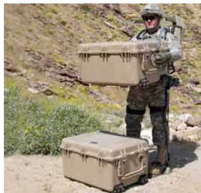
ORLANDO -- Lockheed Martin has received a $1.1 million contract from the U.S. Army Natick Soldier Center for test and evaluation of its next-generation HULC™ advanced robotic exoskeleton, designed to augment Soldiers' strength and endurance, as well as reduce load carriage injuries.

Under this contract, the U.S. Army will test Lockheed Martin's advanced ruggedized HULC design. The upgraded HULC system includes optimized control software, extended battery life and human factors improvements for quicker and easier sizing to each user. Lockheed Martin is also exploring exoskeleton designs to support industrial and medical applications.