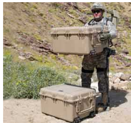
ORLANDO -- Lockheed Martin has received a $1.1 million contract from the U.S. Army Natick Soldier Center for test and evaluation of its next-generation HULC™ advanced robotic exoskeleton, designed to augment Soldiers' strength and endurance, as well as reduce load carriage injuries.

Under this contract, the U.S. Army will test Lockheed Martin's advanced ruggedized HULC design. The upgraded HULC system includes optimized control software, extended battery life and human factors improvements for quicker and easier sizing to each user. Lockheed Martin is also exploring exoskeleton designs to support industrial and medical applications.