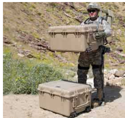
ORLANDO -- Lockheed Martin has received a $1.1 million contract from the U.S. Army Natick Soldier Center for test and evaluation of its next-generation HULC™ advanced robotic exoskeleton, designed to augment Soldiers' strength and endurance, as well as reduce load carriage injuries.

Under this contract, the U.S. Army will test Lockheed Martin's advanced ruggedized HULC design. The upgraded HULC system includes optimized control software, extended battery life and human factors improvements for quicker and easier sizing to each user. Lockheed Martin is also exploring exoskeleton designs to support industrial and medical applications.