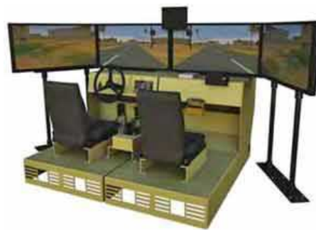
Daytona Beach, Fla. – Raydon Corp. was awarded on July 9 a $36,355,550 firm-fixed-price contract.

This contract is for 11 Mine Resistant Ambush Protected Vehicle virtual trainers for the Army National Guard. Work is to be performed in Daytona Beach, Fla., with an estimated completion date of Nov. 30, 2011. Over 50 bids were solicited with one bid received. National Guard Bureau, ZC-AQ, Arlington, Va., is the contracting activity (W9133L-10-F-0130).