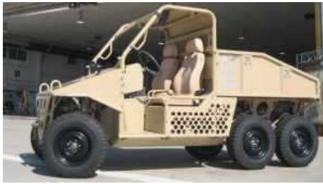
Alexandria, Virginia -- The LASSO® (Land, Air & Sea Special Operations) vehicle is the result of thousands of hours of research, engineering, design and testing by VSE Corporation.

What sets this compact, all-terrain vehicle apart is its true, full-time, six-wheel drive with a fully independent suspension, 9-inches of suspension travel, 12-inches of ground clearance and a payload capacity of 3,000 pounds--allowing for high capacity load carrying in hard-to-travel environments.