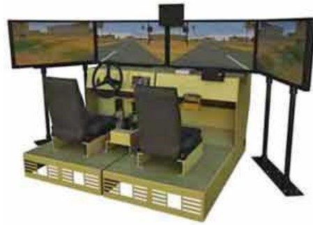
Daytona Beach, Fla. – Raydon Corp. was awarded on July 9 a $36,355,550 firm-fixed-price contract.

This contract is for 11 Mine Resistant Ambush Protected Vehicle virtual trainers for the Army National Guard. Work is to be performed in Daytona Beach, Fla., with an estimated completion date of Nov. 30, 2011. Over 50 bids were solicited with one bid received. National Guard Bureau, ZC-AQ, Arlington, Va., is the contracting activity (W9133L-10-F-0130).