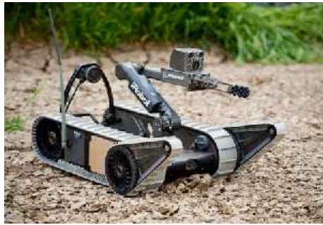
HUNTSVILLE, Ala. -- The Boeing Company and partner iRobot Corp. today announced that they have received a new task order to an existing contract to provide Small Unmanned Ground Vehicles (SUGV) to the U.S. Army.

The order calls for 94 new model 310 SUGV robots, plus spares, for a total value of $14.6 million.