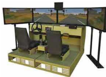
Daytona Beach, Fla. – Raydon Corp. was awarded on July 9 a $36,355,550 firm-fixed-price contract.

This contract is for 11 Mine Resistant Ambush Protected Vehicle virtual trainers for the Army National Guard. Work is to be performed in Daytona Beach, Fla., with an estimated completion date of Nov. 30, 2011. Over 50 bids were solicited with one bid received. National Guard Bureau, ZC-AQ, Arlington, Va., is the contracting activity (W9133L-10-F-0130).