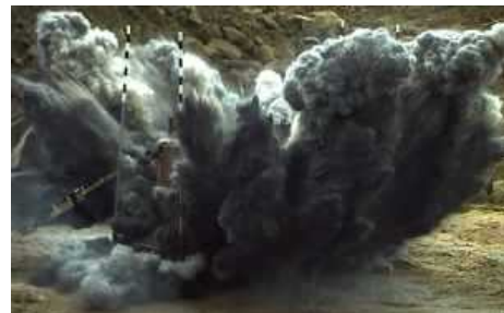
The all-new, all-British Supacat SPV400, which is competing to win a UK Ministry of Defence J200 million Urgent Operational Requirement for a Light Protected Patrol Vehicle (LPPV) to replace the Snatch Land Rover, last week completed a fourth round of blast tests.

These tests were conducted despite the LPPV bid having already been submitted to the MoD.