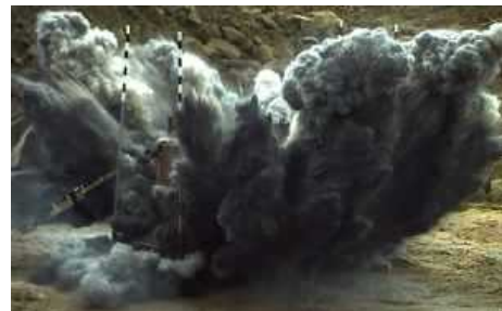
The all-new, all-British Supacat SPV400, which is competing to win a UK Ministry of Defence BJ200 million Urgent Operational Requirement for a Light Protected Patrol Vehicle (LPPV) to replace the Snatch Land Rover, last week completed a fourth round of blast tests.

These tests were conducted despite the LPPV bid having already been submitted to the MoD.