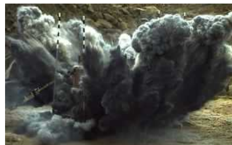
The all-new, all-British Supacat SPV400, which is competing to win a UK Ministry of Defence BJ200 million Urgent Operational Requirement for a Light Protected Patrol Vehicle (LPPV) to replace the Snatch Land Rover, last week completed a fourth round of blast tests.

These tests were conducted despite the LPPV bid having already been submitted to the MoD.