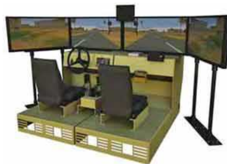
Daytona Beach, Fla. – Raydon Corp. was awarded on July 9 a $36,355,550 firm-fixed-price contract.

This contract is for 11 Mine Resistant Ambush Protected Vehicle virtual trainers for the Army National Guard. Work is to be performed in Daytona Beach, Fla., with an estimated completion date of Nov. 30, 2011. Over 50 bids were solicited with one bid received. National Guard Bureau, ZC-AQ, Arlington, Va., is the contracting activity (W9133L-10-F-0130).