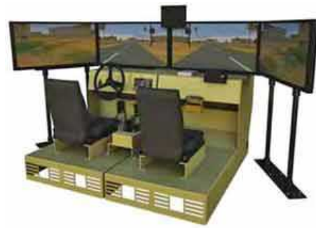
Daytona Beach, Fla. – Raydon Corp. was awarded on July 9 a $36,355,550 firm-fixed-price contract.

This contract is for 11 Mine Resistant Ambush Protected Vehicle virtual trainers for the Army National Guard. Work is to be performed in Daytona Beach, Fla., with an estimated completion date of Nov. 30, 2011. Over 50 bids were solicited with one bid received. National Guard Bureau, ZC-AQ, Arlington, Va., is the contracting activity (W9133L-10-F-0130).