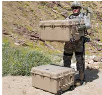
ORLANDO -- Lockheed Martin has received a $1.1 million contract from the U.S. Army Natick Soldier Center for test and evaluation of its next-generation HULC™ advanced robotic exoskeleton, designed to augment Soldiers' strength and endurance, as well as reduce load carriage injuries.

Under this contract, the U.S. Army will test Lockheed Martin's advanced ruggedized HULC design. The upgraded HULC system includes optimized control software, extended battery life and human factors improvements for quicker and easier sizing to each user. Lockheed Martin is also exploring exoskeleton designs to support industrial and medical applications.