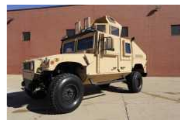
WASHINGTON, D.C. -- BAE Systems introduced a lightweight monocoque V-hull HMMWV recap