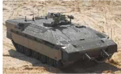
STERLING HEIGHTS, Mich. -- General Dynamics Land Systems, a business unit of General Dynamics, has been selected to negotiate a contract with the Israeli Ministry of Defense for Merkava Armored Personnel Carriers (APC).

The competitive procurement process was for the production of Merkava APC hulls, material kit sets and integration of the kits to the vehicle chassis. General Dynamics expects to complete contract negotiations by the end of this year.