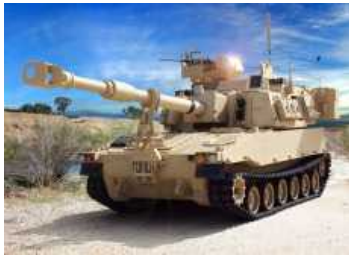
YORK, Pennsylvania -- BAE Systems has delivered seven Paladin Integrated Management (PIM) prototype vehicles to the U.S. Army on schedule. PIM is the latest howitzer in the M109 Paladin family of vehicles.

BAE Systems was awarded a $63.9 million research and development contract in August 2009 to produce five Self Propelled Howitzers and two Carrier, Ammunition, Tracked vehicles. The first prototype vehicle was unveiled earlier this year in January.