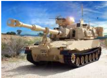
YORK, Pennsylvania -- BAE Systems has delivered seven Paladin Integrated Management (PIM) prototype vehicles to the U.S. Army on schedule. PIM is the latest howitzer in the M109 Paladin family of vehicles.

BAE Systems was awarded a $63.9 million research and development contract in August 2009 to produce five Self Propelled Howitzers and two Carrier, Ammunition, Tracked vehicles. The first prototype vehicle was unveiled earlier this year in January.