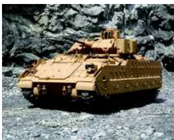
YORK, Pennsylvania -- BAE Systems will extend the