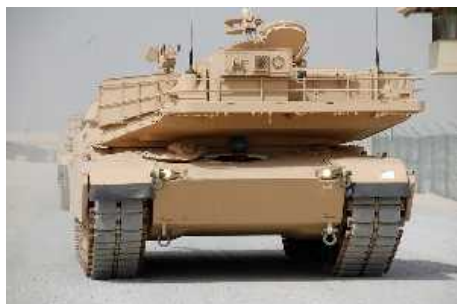
Washington -- The Army's next combat vehicle must perform through the full spectrum of Army operations, be designed to protect itself and the Soldier, and be built with a budget in mind.

Nearly 300 attendees gathered at an industry day Oct.