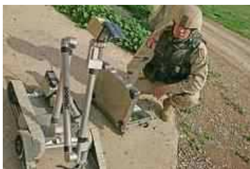
Bedford, Mass. -- iRobot Corp., a leader in delivering robotic technology-based solutions, today announced that it has received a $14 million order from the U.S. Army TACOM Contracting Center in Warren, Mich.

The order calls for the delivery of iRobot Aware(R) 2 robot intelligence software and spare parts for iRobot PackBot tactical mobile robots. This order will allow the Army to upgrade its existing iRobot 510 FasTac fleet to the iRobot 510 PackBot multi-mission robot.