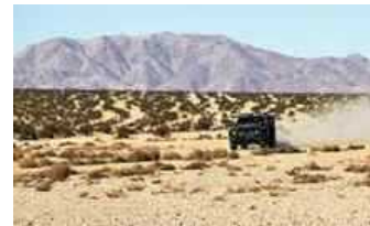
OSHKOSH, Wis. -- Oshkosh Defense, a division of Oshkosh Corporation, today unveiled a vehicle to demonstrate the future of light tactical wheeled vehicles at the AUSA 2010 Annual Meeting & Exposition.

This vehicle, called the Light Combat Tactical Vehicle (LCTV), features the company's latest advancements in off-road mobility, performance and protection for the U.S. military – including the next-generation of TAK-4® independent suspension systems. The new system provides increased off-road mobility, improved vehicle maneuverability and smoother ride quality.