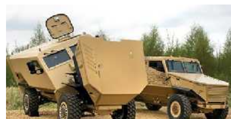
Ladson -- Force Protection Australasia, a Force