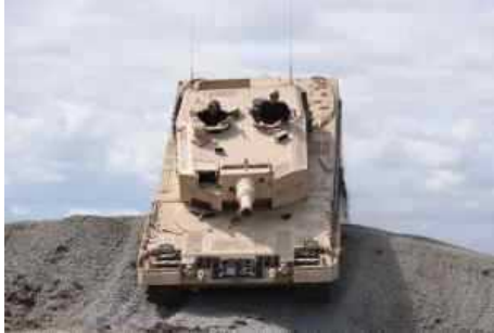
Marking the African debut of the Leopard 2A4, Rheinmetall Defence of Germany took advantage of Africa Aerospace & Defence 2010 (AAD) in Cape Town to put the world's finest main battle tank through its paces.

Daily live presentations on a special test track proved to be a major draw, with the Leopard 2A4's excellent mobility in rough terrain clearly impressing the crowd.