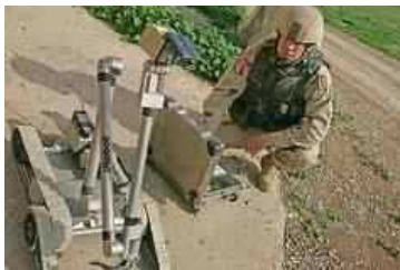
Bedford, Mass. -- iRobot Corp., a leader in delivering robotic technology-based solutions, today announced that it has received a $14 million order from the U.S. Army TACOM Contracting Center in Warren, Mich.

The order calls for the delivery of iRobot Aware(R) 2 robot intelligence software and spare parts for iRobot PackBot tactical mobile robots. This order will allow the Army to upgrade its existing iRobot 510 FasTac fleet to the iRobot 510 PackBot multi-mission robot.