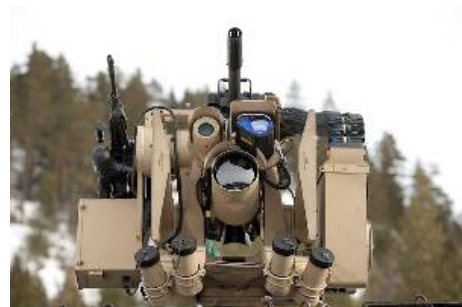
The Canadian Treasury Board announced that they have chosen Textron Systems to deliver the next generation of Tactical Armoured Patrol Vehicles (TAPV).

Textron Systems, the vehicle provider, is in a close partnership with KONGSBERG, for the delivery of an advanced Dual Remote Weapon Station (DRWS) tailor-made to address the specific TAPV requirements.