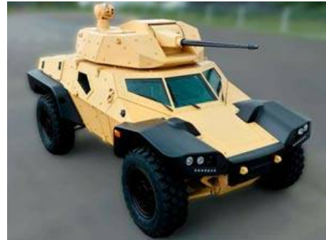
Panhard General Defence, leader in the area of light armoured vehicles - under 15 tons, will display the whole range of products, combat vehicles, liaison vehicles and support vehicles, as well as its range of remote-controlled weapon systems.