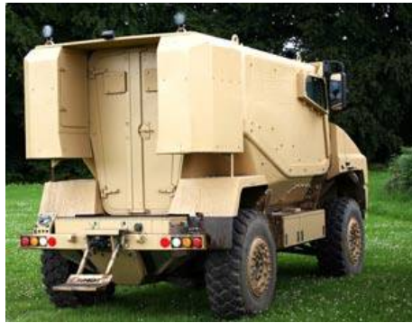
Dunkeswell, Devon, UK -- At Eurosatory 2012 Supacat is exhibiting the latest production standard Supacat Protected Vehicle 400 (SPV400), which offers improved reliability and handling after having completed over 21,000km of trials, during which its reliability level has increased to 96%.

These improvements were demonstrated in March at Millbrook Proving Ground where the SPV400 (Vehicle 7) performed robustly in pre-feasibility trials for the UK Ministry of Defence's Multi Role Vehicle -Protected (MRV-P) requirement.