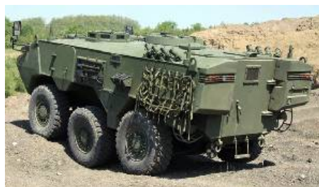
Otokar, the leading land system manufacturer of the Turkish Defence Industry, is to exhibit its 4x4 and 6x6 armoured vehicles at Eurosatory.