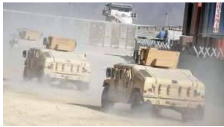
A historic mission for the 401st Army Field Support Brigade came to an end, Nov. 12, when AFSBn-Bagram issued 49 M1114 vehicles to the Afghan National Army, under a Foreign Military Sales case.

The 49 vehicles were the last of more than 950 vehicles that were involved in the program that lasted about two and one-half years. Before the vehicles were turned over to the ANA, they were completely checked and restored to a fully mission capable status at AFSBn-Bagram and Camp Lindsey near Kandahar. In some cases, the vehicle was practically rebuilt from the ground up, while other vehicles required only minor repair and refurbishment.