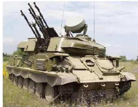
Self-propelled anti-aircraft weapon, or self-propelled air defense system, is a mobile vehicle with a dedicated anti-aircraft capability.

Specific weapon systems used include machine guns, autocannons, larger guns, or missiles, and some mount both guns and longer-ranged missiles. Platforms used include both trucks and heavier combat vehicles such as armoured personnel carriers and tanks, which add protection from aircraft, artillery, and small arms fire for front line deployment.