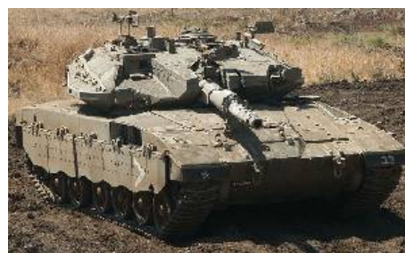
Sloped armour is armour that is mounted at a non-vertical and non-horizontal angle, typically on battle tanks and other armoured fighting vehicles.

For a given normal to the surface of the armour, its plate thickness, increasing armour slope improves the armour's level of protection by increasing the thickness measured on a horizontal plane, while for a given area density of the armour the protection can be either increased or reduced by other sloping effects, depending on the armour materials used and the qualities of the projectile that hits it. The increased protection caused by increasing the slope while keeping the plate thickness constant, is due to a proportional increase of area density and thus mass, and thus offers no weight benefit. Therefore the other possible effects of sloping, such as deflection, deforming and ricochet of a projectile, have