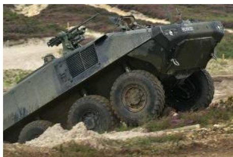
General Dynamics European Land Systems and Falck Schmidt Defence Systems have signed a comprehensive teaming agreement to respond to the requests for the Danish Armored Personnel Carriers Replacement (APC-R) Program.

Under the teaming agreement, General Dynamics European Land Systems (GDELS) and Falck Schmidt Defence Systems (FSDS), a leading Defence contractor in Denmark, are working together to provide the best armored personnel carrier for the Danish Army.