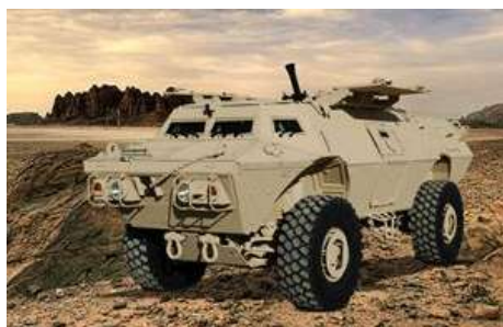
IDEX 2013 – Abu Dhabi – February 17, 2013