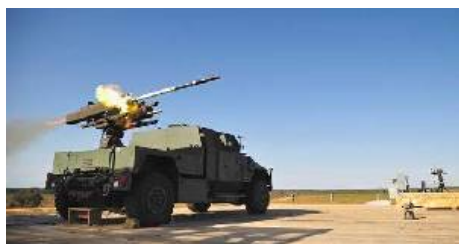
Lockheed Martin recently demonstrated the ability of its DAGR missile to launch from a ground vehicle during a series of flight tests at Eglin Air Force Base, Fla.

DAGR and two Hydra 70 rockets were launched from a pedestal launcher mounted in the bed of a Lockheed Martin prototype Joint Light Tactical Vehicle (JLTV). DAGR locked onto the laser spot two seconds after launch, flew 5 km down range and impacted the target within 1 meter of the laser spot. The unguided Hydra 70 rockets were launched down the center of the range, and flew 521 and 2,600 meters, respectively.