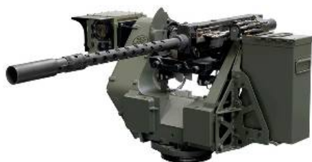
Two armored vehicle manufacturers, Renault Trucks Defense and Streit, have selected the deFNder® Remote Weapon Station designed, developed and