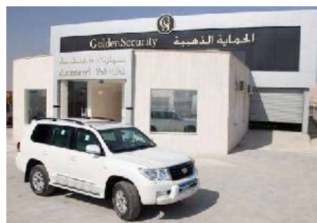
At the exhibition IDEX 2013, UAE, Golden Security Ltd. presented its latest vehicle - Toyota Land Cruiser 200 armored to the level VR 10 / Stanag 3-.

This level of protection is the next after B7 (standards EN 1063 / EN 1522) and according to the company's information the vehicle became the most protected civil vehicle in the world - perhaps excluding the vehicle of the US president, the protection level of which is not disclosed.