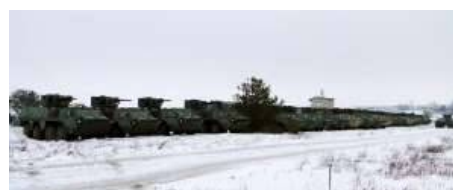
On 7 February, in Kiev, the representatives of the Ministry of Defence of the Republic of Iraq and those of the State Company "Ukrspesexport" signed the document that confirms the acceptance of another batch of Ukrainian-made BTR-4 armoured personnel carriers. The batch consists of 40