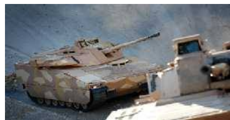
A November planning session in Ottawa was the latest development in BAE Systems’ drive to ensure Canadian industry has a major role to play in the Close Combat Vehicle (CCV) program.

BAE Systems has selected a coast-to-coast Canadian team of companies which would play a major role in the