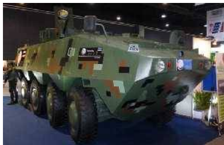
Black Widow Spider 8x8 concept on display at the Defence & Security 2013 exhibition, Bangkok

The Defence Technology Institute (DTI) – the Thai ministry of defence's research and development agency – today announced that it will partner with Ricardo on the next phase of development of its Black Widow Spider 8x8 armoured vehicle programme in support of the Royal Thai Army.