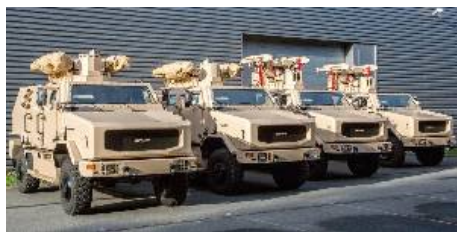
Bourges, France -- MBDA has just completed the integration and factory acceptance test of the first Multi-Purpose Combat Vehicle (MPCV) vehicles designed to operate the Mistral surface to air missile.

Built for export, these vehicles represent the first production batch. In the next few days, they will be shipped for delivery to the customer country before the end of the year, as announced at the contract signing in February 2011.