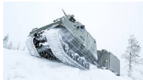
Rheinmetall Canada Inc will display the BAE Systems BvS10 all-terrain vehicle on its outdoor stand (#2102) at the CANSEC defense exhibition in Ottawa from May 28 through May 29.

The move follows a teaming agreement signed by the two companies in late 2013 as part of a future bid for the Marginal Terrain Vehicles (MTV) program in Canada, offering the BvS10.