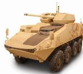
KONGSBERG is unveiling the latest PROTECTOR MCT-30 vehicle integration at the Eurosatory exhibition.

General Dynamics Land Systems and KONGSBERG will unveil its latest vehicle integration at Eurosatory. The PROTECTOR MCT-30 and LAV integration will be exhibited for the first time in Paris during the exhibition.