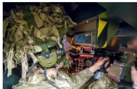
Warminster, Wiltshire -- The Ministry of Defence (MoD) is investing J11 million in additional support for the virtual training system used to prepare British soldiers for battle.

Lockheed Martin has been awarded a contract extension to continue its support for the Combined Arms Tactical Trainer (CATT), which is based at the Land Warfare Centre in Warminster. BAE Systems will also provide support services for the contract.