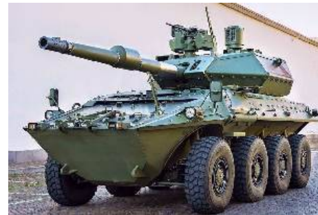
Eurosatory 2016 will give the Iveco-Oto Melara Consortium (CIO) the opportunity to display the latest and most innovative achievements in the field of armoured vehicles.

CIO will present in Paris its newly developed Centauro II, the latest evolution of the Centauro Family. The Centauro having been the first 8x8 wheeled antitank vehicle in the world with a high-pressure gun. The Centauro II represents the logical evolution, being armed with a third generation 120/45 mm gun, with integrated muzzle brake and semi-automatic loading system. The weapon system provides a fire power equivalent to that of most modern main battle tanks, and is capable of firing all latest generation 120 mm, NATO APFSDS and multi-role MP munitions.