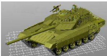
The new Russian 2A82 tank gun, which is now installed in the T-14 Armata Main Battle Tank (MBT) with minor changes, was originally conceived and developed for a different purpose — to modernize

the numerous fleet of T-72 and T-80 MBTs and, firstly and foremost, to equip new modifications of the T-90 MBT.