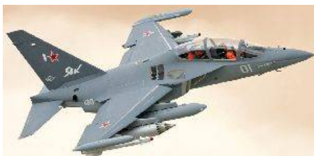
The Yak-130 combat training aircraft was designed by Yakovlev Design Bureau along with Italy's Aermacchi, and production was launched in 2009 by the Irkut Corporation in Russia.

One of the strengths of the plane was a Ukrainian designed AI-222-25 engine created by Ivchenko-Progress SOE. The engine was subsequently produced by Russia's Salyut Scientific-Production Centre for Gas Turbine Construction, in accordance with a license agreement between the Ukrainian and Russian