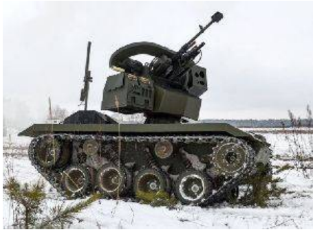
The Ministry of Defense of Russia has published video of testing the latest Russian Nerekhta Combat Unmanned Ground Vehicle (CUGV) which interacts with the fighters of motorized rifle units.