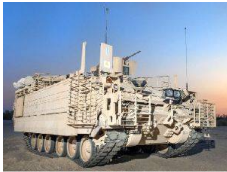
The U.S. Army has awarded BAE Systems two contract modifications worth up to $575 million for the low-rate initial production of the Armored Multi-Purpose Vehicle (AMPV).

These awards mark the beginning of low-rate production for the highly mobile, survivable, multipurpose vehicle designed to meet the mission of the U.S. Army's Armored Brigade Combat Teams (ABCT).