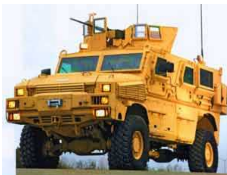
The Department of Defense today announced a