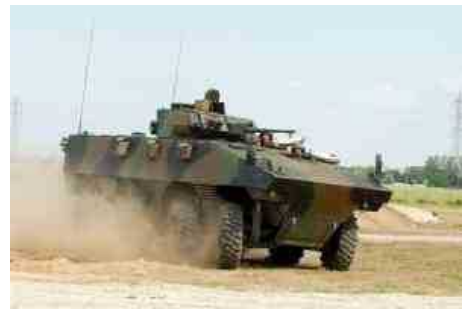
On 5th December 2008, the DGA (French armament procurement agency) issued a purchase order to Nexter for the delivery of 116 infantry combat armoured vehicles (VBCI). This order brings the total number of vehicles ordered to date to 298 VBCIs.

The DGA has accepted the first 41 vehicles in accordance with the initial schedule.