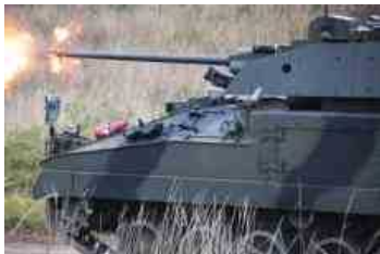
KIRKCUDBRIGHT, Scotland -- British troops could get a major increase in firepower thanks to a revolutionary gun system and advanced turret destined for their armoured fighting vehicles.

Senior officials from the UK Ministry of Defence (MOD) and its French equivalent, the DGA, saw the system in action on a Warrior vehicle at the Kirkcudbright range in Scotland. The BAE Systems MTIP2 turret and its Cased Telescoped Armament System (CTAS) is already cleared to fire from a moving vehicle at a moving target.