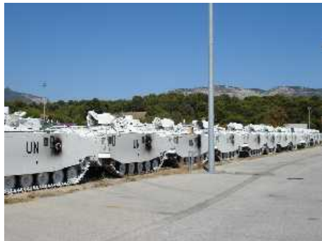
Versailles Satory, December 17th, 2008 - Nexter has just finished upgrading 108 AMX 10P tracked armored personnel carriers ahead of the initial schedule.

This upgrade was carried out in six French Army infantry regiments. The last armored vehicle was returned to the 92nd Clermont-Ferrand Infantry Regiment on October 23, 2008.