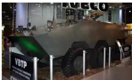
The Brazilian Army and Iveco Latin America today signed a contract for the supply of 2044 units of the base model of the new family of armoured personnel carriers (VBTP-MR).

The vehicles will replace the old models Urutu used today by the Brazilian armed forces. The contract is valued at 6 billion Brazilian Reais (about €2.5 billion) over 20 years.