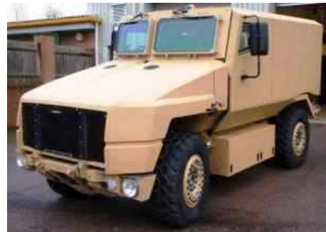
The first running prototype of the Supacat Protected Vehicle (SPV) 400 is officially revealed by Supacat Ltd.

The vehicle is currently being subjected to a detailed trials programme. The second SPV400 prototype is being completed at Supacat's Devon, UK, facility and will enter the trials programme towards the end January. Further development vehicles are scheduled to follow.