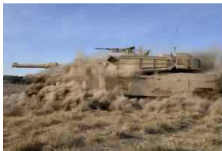
STERLING HEIGHTS, Mich. -- The U.S. Army Tank