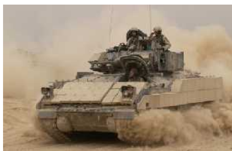
CHARLOTTE, N.C. -- General Dynamics Armament and Technical Products has been awarded an order of approximately $33 million to produce reactive armor tile sets for the Bradley Fighting Vehicle by the U.S. Army Contracting Command in Picatinny Arsenal, N.J. Deliveries are expected to begin in June 2010.

General Dynamics Armament and Technical Products is a business unit of General Dynamics.