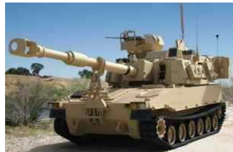
York, Pennsylvania -- BAE Systems today unveiled its upgraded PIM (Paladin Integrated Management) vehicle to military customers, Congressional representatives, community leaders and employees at a ceremony held at its York facility.

PIM is the next generation howitzer in the M-109 Paladin family of vehicles, a combat proven weapon system manufactured by BAE Systems at York.