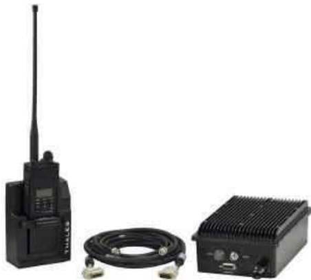
These contracts were awarded under the Consolidated, Interim, Single-Channel Handheld Radio (CISCHR) contract

Thales Communications, Inc., a pioneer and global leader in the development, manufacture, and support of multiband, software-defined radio (SDR) equipment, announces the award of two contracts by the Joint Program Executive Office Joint Tactical Radio System (JPEO JTRS) to provide Cradle Vehicle Adapters (CVAs) for the U.S. Marine Corps. Under these contracts, Thales will deliver 11,000 50-Watt CVAs to the Marine Corps for use with previously-purchased Thales AN/PRC-148 JTRS-approved radios. These contracts were awarded under the Consolidated, Interim, Single-Channel Handheld Radio (CISCHR) contract.