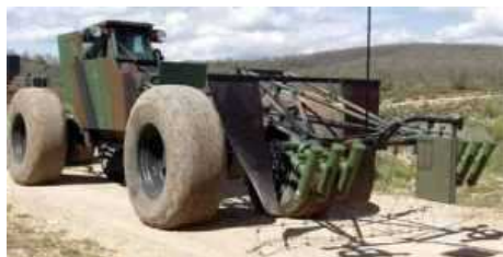
Development of SOUVIM 2, a mine path clearing system designed and manufactured by MBDA since 2008, has just been completed.

Two units of this land vehicle set will be delivered very shortly to the DGA, the French armament procurement agency and will undergo final qualification testing before delivery to the French Army. In line with the DGA's aim, the French Army will be ready to deploy this system on foreign theatres in 2010.