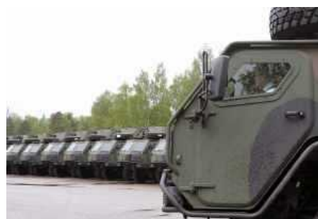
Delivered trucks are equipped with effective mine protection and feature a cabin of armour steel.

Finnish military vehicle supplier, Sisu Defence Oy, has handed over 60 High Mobility SISU 8x8 Military Trucks to Finnish Army. The delivery was received by the Minister of Defence, Jyri Hakamies, at Sisu factory in Raasepori, Finland, on 24.5.2010.