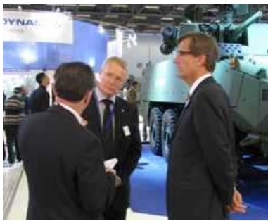
KONGSBERG's largest remote weapon station, the PROTECTOR Medium Caliber RWS, was presented for the first time to the European market at Eurosatory 2010.

One model was unveiled at General Dynamic's stand mounted on Mowag's new Piranha Class 5 wheeled armoured vehicle. The second model was showcased at the Finnish defence industry company Patria's stand, mounted on a Patria AMV 8x8 Armoured Wheeled Vehicle.