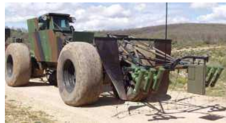
Development of SOUVIM 2, a mine path clearing system designed and manufactured by MBDA since 2008, has just been completed.

Two units of this land vehicle set will be delivered very shortly to the DGA, the French armament procurement agency and will undergo final qualification testing before delivery to the French Army. In line with the DGA's aim, the French Army will be ready to deploy this system on foreign theatres in 2010.