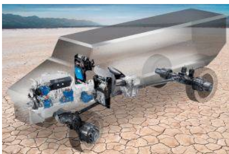
Mercedes-Benz Special Chassis, business unit of Mercedes-Benz, will release new FGA Component Kit and FGA 14.5 Special Chassis at Eurosatory 2012 (11 - 15 June 2012).