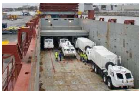
Finnish Forces shall resume participation in an UN operation in Lebanon mid May, 2012, after absence of five years. As earlier, also this time Sisu branded vehicles shall play a vital role in the theatre. This time the deployed vehicles include also the new ETP 8x8 trucks featuring the up-to-date armouring solutions of Sisu Defence.

The gear necessary for a successful operation was loaded to a ship heading to Beirut in Rauma harbour, Finland, on April 22, 2012.