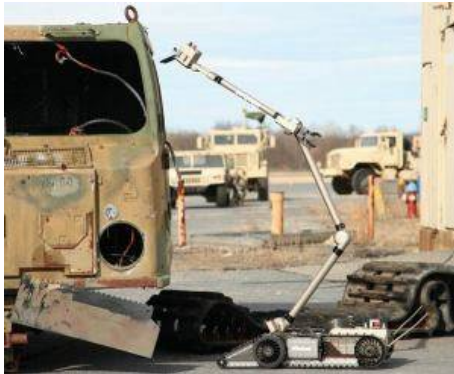
iRobot Corp., a leader in delivering robotic technology-based solutions, has received two orders from the U.S. Army's Robotic Systems Joint Program Office (RSJPO) totaling $6 million.

The orders call for the delivery of spares for iRobot 510 PackBot robots, including operator control units, manipulator arms and radios. All deliveries will be completed by November 30, 2012.