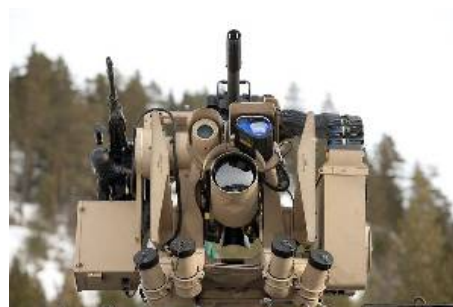
The Canadian Treasury Board announced that they have chosen Textron Systems to deliver the next generation of Tactical Armoured Patrol Vehicles (TAPV).

Textron Systems, the vehicle provider, is in a close partnership with KONGSBERG, for the delivery of an advanced Dual Remote Weapon Station (DRWS) tailor-made to address the specific TAPV requirements.