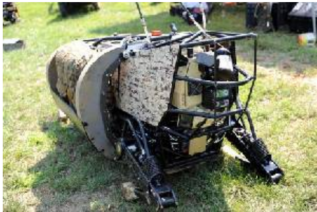
Two completed prototype robotic “pack mules” exhibit reduced noise, new gaits, and improved perception