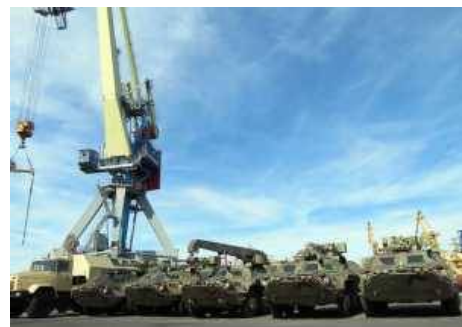
On 12 September a batch of 62 BTR-4 armoured personnel carriers (APC) started to be loaded on a ship at the Odessa Seaport in order to be transported by sea to Iraq.

On 13 September the loading is to be completed, and the vessel will go to the country of destination. The vessel is to arrive at the Iraqi port Um Qasr early in October 2012. The loading procedure was supervised by the Ambassador of Iraq in Ukraine Shorsh Khalid Sayed.