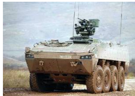
The Ministry of Defense of the Republic of Slovenia (MoD), Rotis Plus d.o.o. and Patria have signed a Settlement Agreement governing the AMV vehicle supply contract and the related offset agreement signed in 2006.

The settlement includes a change of the fleet size to consist of 30 Svarun vehicles that have already been delivered and closing down the rest of the project and thus the supply contract. With this settlement the original offset agreement is deemed fulfilled. Patria will take over the life cycle support for the delivered vehicles from Rotis Plus.