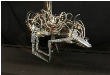
DARPA's Cheetah robot—already the fastest legged robot in history—just broke its own land speed record of 18 miles per hour (mph). In the process, Cheetah also surpassed another very fast mover: Usain Bolt.

According to the International Association of Athletics Federations, Bolt set the world speed record for a human in 2009 when he reached a peak speed of 27.78 mph for a 20-meter split during the 100-meter sprint. Cheetah was recently clocked at 28.3 mph for a 20-meter split. The Cheetah had a slight advantage over Bolt as it ran on a treadmill, the equivalent of a 28.3 mph tail wind, but most of the power Cheetah used was to swing and lift its legs fast enough, not to propel itself forward.